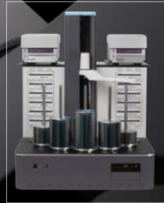
High Capacity Mixed Media CD/DVD Production Microtech's Xpress XL